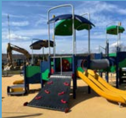
Bacton Hill Park

Currently, the park is under construction. Township staff is also working with other consultants and interested parties on the details of the park, most importantly the all-abilities playground and new signs. Stay tuned for more updates!