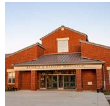
Summer camp location